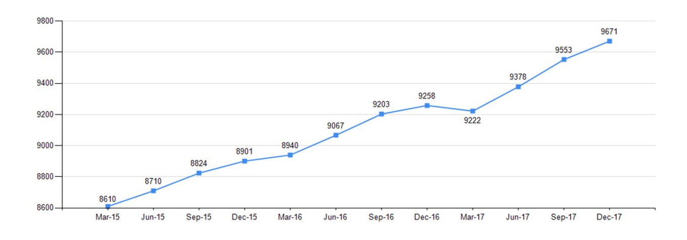
Table 4.2 Change in the number of approved supervisors<sup>4</sup>